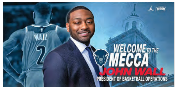
JOHN WALL: Former NBA top pick to join Howard basketball.