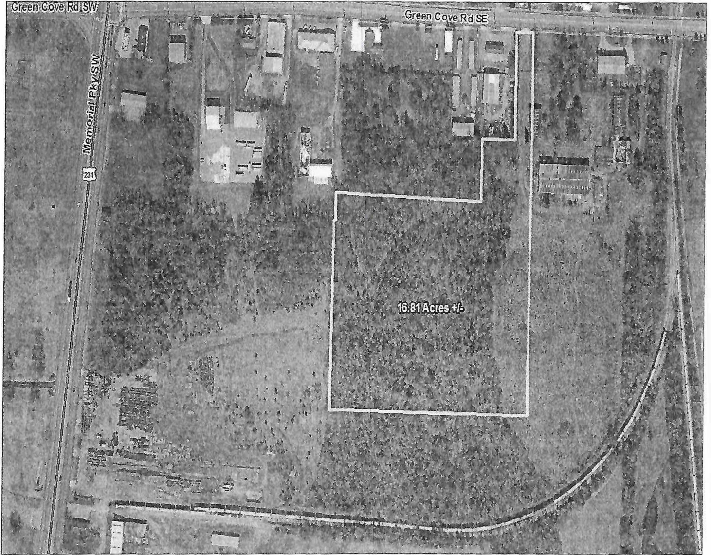
Exhibit "A" (Depiction of Property)